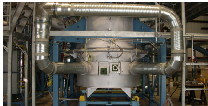
Custom Plasma Reactors