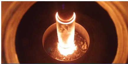
Process Development Services

PyroGenesis' technology development services can be classified into 2 main categories: