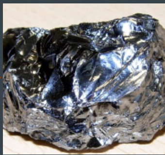
HIGH GRADE SILICON