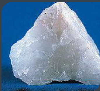
HIGH GRADE QUARTZ